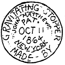
Sketch of Aqua colored bottle (7 1/4 inches High) used by the firm.