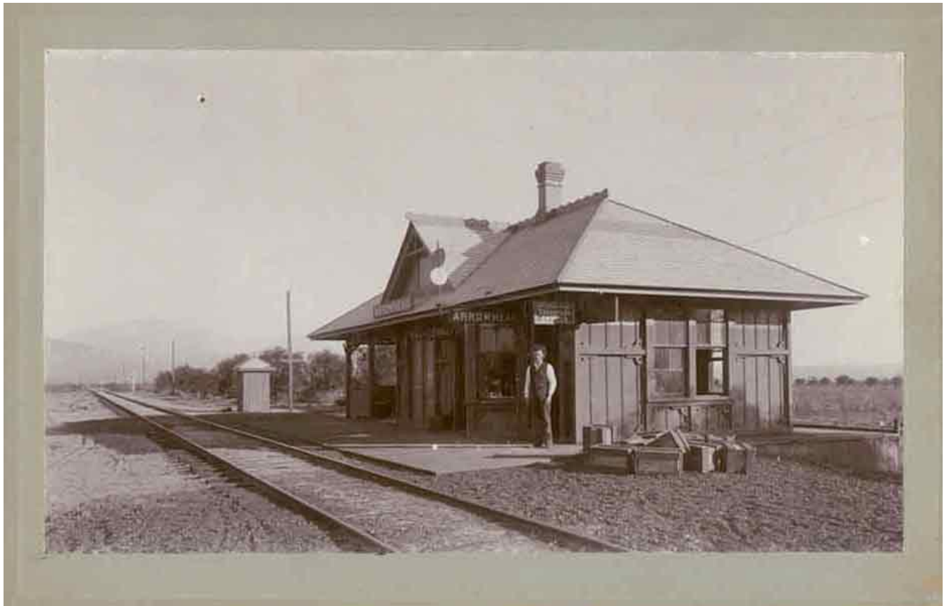
Arrowhead Station — 1887

A station was established mid-way between today's Mt. View and Arrowhead Avenues and a post office was built close by. The land encompassing the station became known as the Arrowhead Tract, and just east of it became known as Arrowhead Junction Tract.