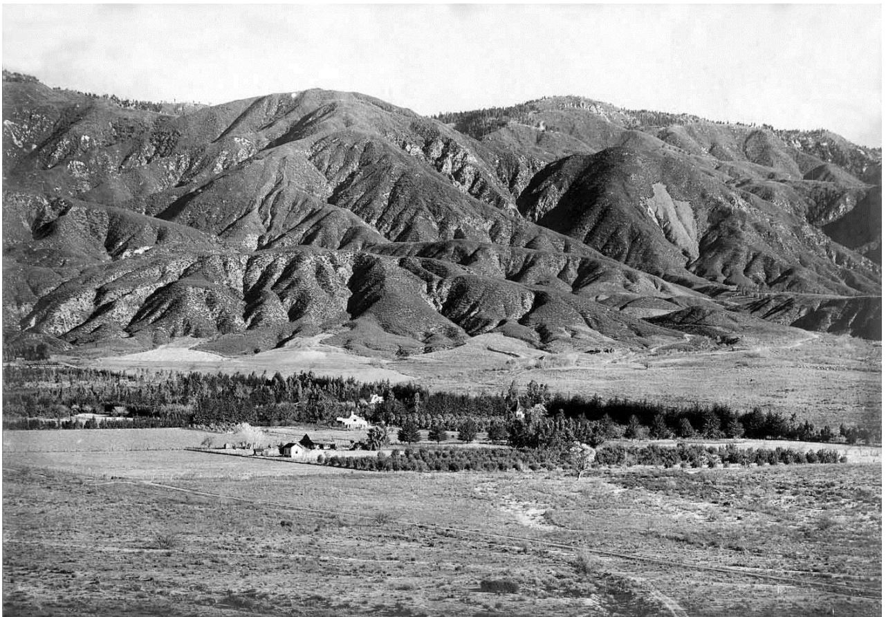
Arrowhead Settlement in 1904

Finally, a consensus was reached with the name “Arrowhead Settlement”—so named because of the near-perfect figure of an arrowhead pointing downward in the foothills of the San Bernardino Mountains directly north of the small community.